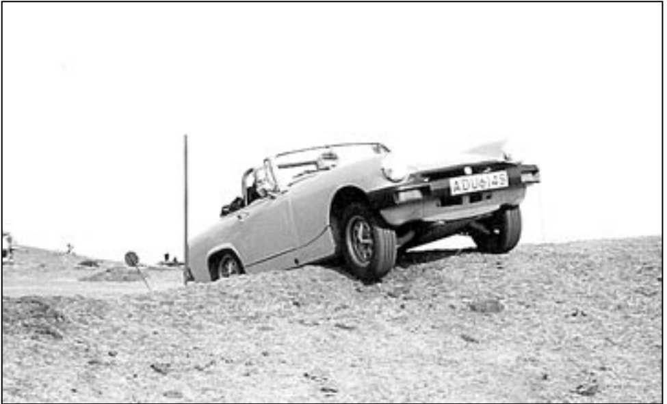
Dave Bowlas 2003